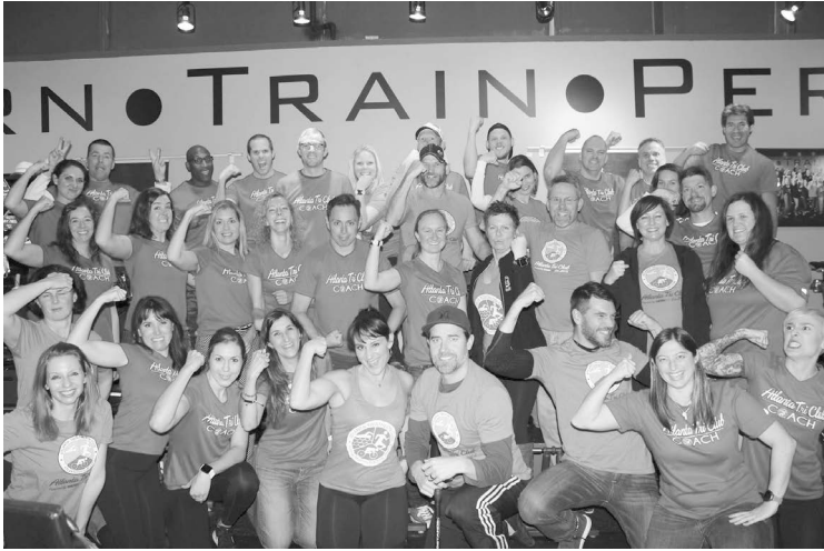
Atlanta Tri Club coaches, 2018